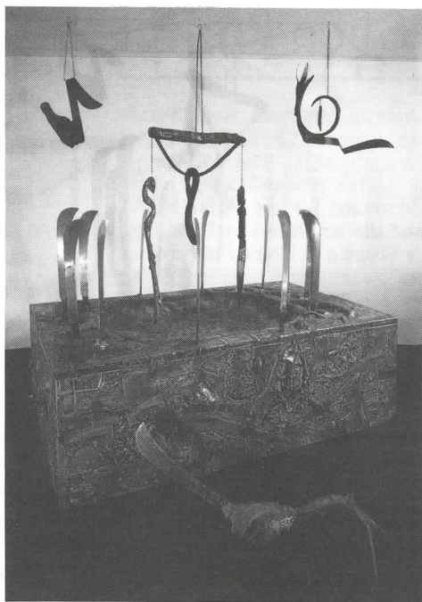
Linda Stein, Blades 208-213 , 1993, steel, wood, stone & mixed media, 8'x9'x8.5'