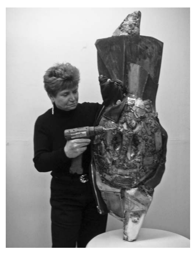
FIGURE 2 ( K )Night Figure 470, 2004. Wood, metal, leather, fiber, stone. 49'' \times 19'' \times 7'' . Rodman Collection. (Reprinted with permission.)

position surrounding fashion and embodiment, the series is a meditation on the politics of representation, as I shall argue. Stein writes: