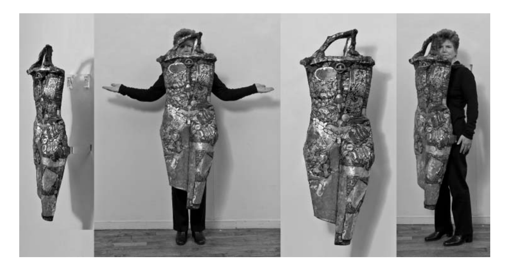
FIGURE 8 Vestment 628 , 2008. Wood, metal. 52'' \times 18'' \times 6'' (12" lucite extensions). (Reprinted with permission.)

of punctuation, repetition, and parataxis); and discursive heterogeneity (for instance, juxtapositions of beauty and stench; multi-sensory, even synaesthetic, description; and interweavings of myth, fairy tale, incantation, and everyday narrative). Within this heterogeneity, and of particular relevance to the present discussion as I shall show, is Wittig's "lacunary writing" (Wittig, On Monique Wittig , 38), a weapon in service of upheaval.<sup>2</sup> Her radical interrogation of language and of the heterosexual system fosters a space for new subjectivity. As she explains: "The bar in my j/e is a sign of excess. A sign that helps to imagine an excess of 'I,' an 'I' exalted in its lesbian passion, an 'I' so powerful that it can attack the order of heterosexuality in texts and lesbianize the heroes of love, lesbianize the symbols" (Wittig, On Monique Wittig , 47).