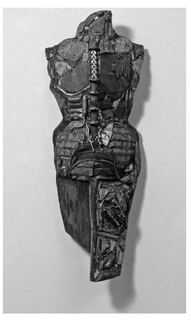
FIGURE 1 Power 581, 2007. Wood, metal, stone. 48'' \times 16'' \times 8'' . (Reprinted with permission.)

A series begun in the aftermath of 9/11 by New York–based sculptor Linda Stein offers an interesting corrective view. While on its website the Metropolitan hails the superhero as the "ultimate metaphor for fashion and its ability to empower and transform the human body" (http://www.metmuseum.org/), Stein's Knight Series , of which I include several examples (Figures 1–9), probes fundamental questions about where power and heroism are located and their desirability. Inscribing a fraught