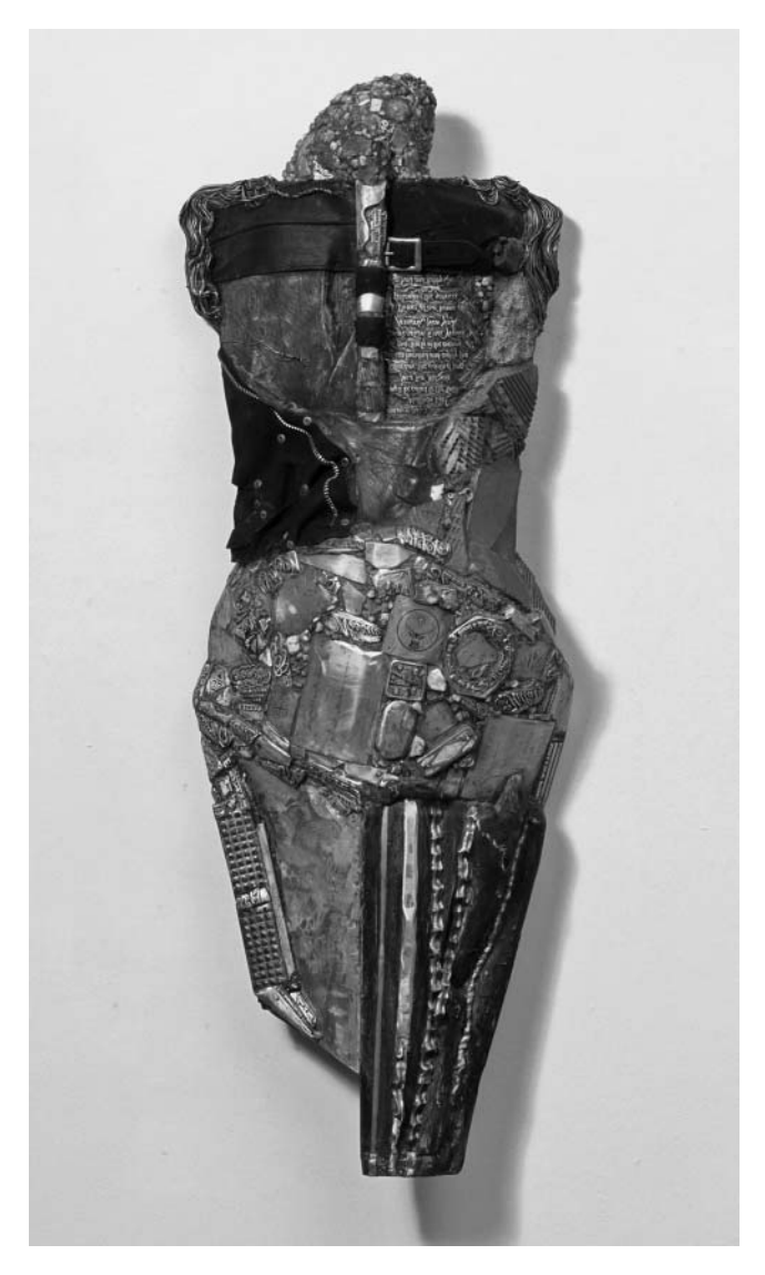
FIGURE 4 Knight of Appreciation 559 , 2006. Wood, metal, stone, leather. 49'' \times 17'' \times 8'' . (Reprinted with permission.)

Monique Wittig (1935–2003), whose articulation of challenges in and imaginative strategies surrounding coming to representation, engagement with female warrior violence, and emphasis on the body as cultural signifier are resonant for Stein, even as her formative early writings emerged in the different context of 2nd-wave feminism and the events of May 1968 (in particular her 1969 novel Les Guérillères ). When Wittig began her text The Lesbian Body (1973), she explains that she found herself in "a double blank"—the writer's blank in initiating her endeavor, and, as she puts it, "the nonexistence of