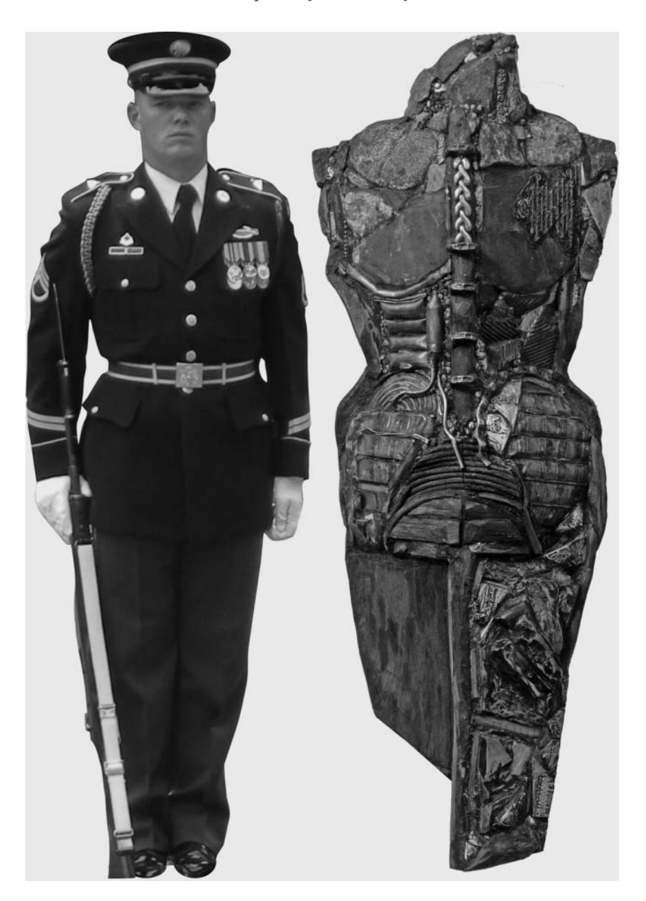
FIGURE 5 Power 581 with Honor Guard from Arlington National Cemetery, 2007. Wood, metal, stone. 48'' \times 16'' \times 8'' . (Reprinted with permission.)

such a book till then" (On Monique Wittig, 44). For the sake of clarity in illustrating Wittig's position, I quote from her at length: