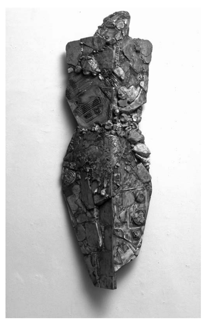
FIGURE 7 Knight of Winged Words 524 , 2005. Wood, metal, stone. 46'' \times 14'' \times 5'' . Falik Collection. (Reprinted with permission.)

what she perceives as a deeply ironic coupling of terms in the title The Lesbian Body due to the masculine gender of the word "body" in the French, which she then qualifies as lesbian, Wittig is able to interrogate the classical body, "little by little as one describes an armor. First the helmet, then the shoulders, then the breastpiece, etc." (Wittig, On Monique Wittig , 46). In Les Guérillières Wittig battles the linguistic order through the pronominal female plural "elles," which she seeks to establish in the text as a universal position; through the creation of new feminized forms such as "quelqu'une" (someone female), "parleuses" (speakeresses), and "chasseuses" (huntresses); syntactical creativity (examples include passages in which there is a dispensation