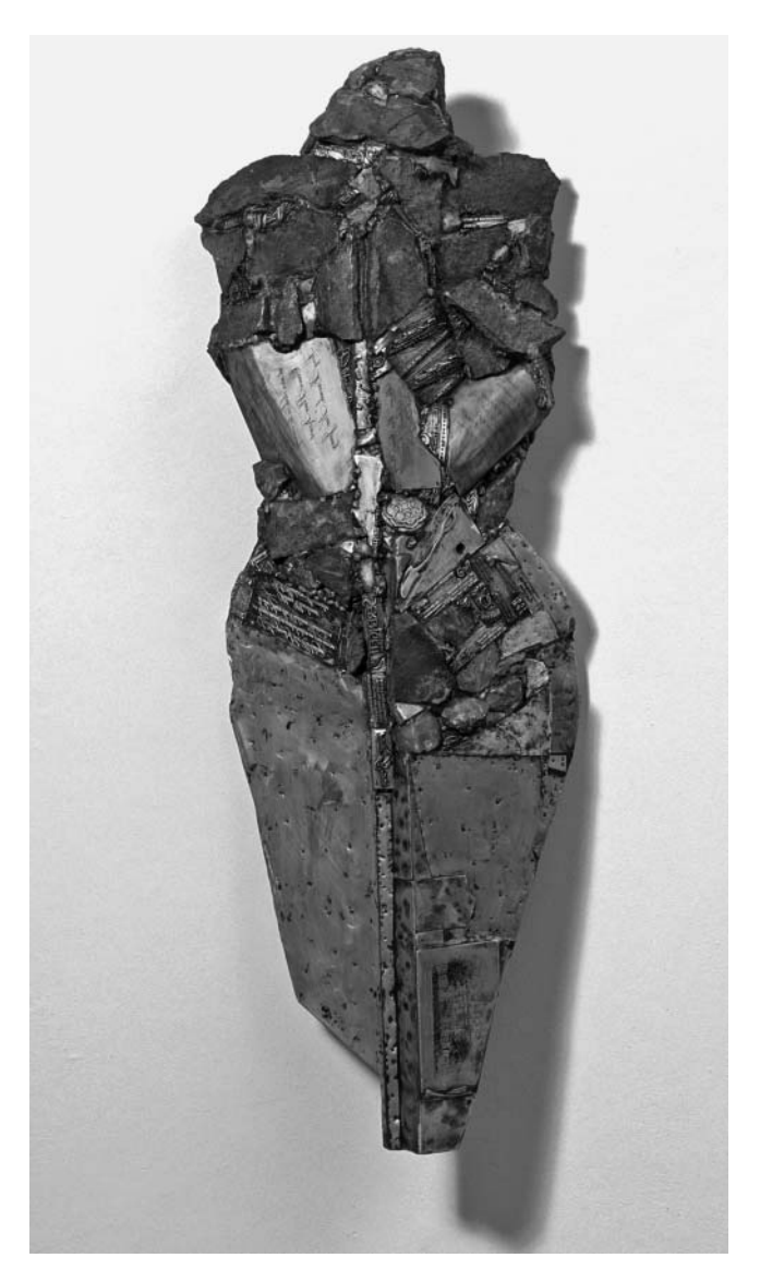
FIGURE 3 Knight of Plenty 553 , 2006. Wood, metal, stone. 47'' \times 16'' \times 6.5'' . (Reprinted with permission.)

in a post-9/11 world for a white, female, middle-class, lesbian subject, Stein writes a crisis of representation. Thus she asks herself of her figures: "How could I create them as warriors when I felt they were symbols of pacifism? How, I wondered could they be fighters in battle when they represented to me everything that cried out for peace?" ( The Power to Protect , 34).