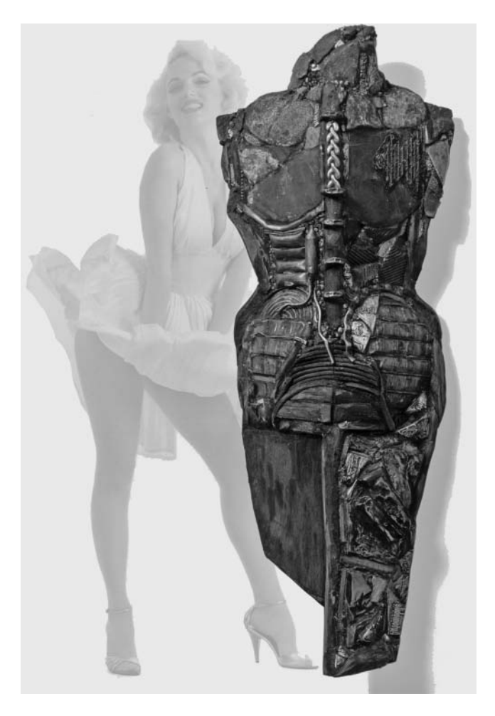
FIGURE 6 Vulnerability/Power 593 , 2007. Wood, metal, stone/printing on vinyl. 48'' \times 40'' \times 8'' . (Reprinted with permission.)

to bring the real body violently to life in the words of the book..., the desire to do violence by writing to the language which I [j/e] can enter only by force. "I" [Je] as a generic feminine subject can only enter by force into a language which is foreign to it, for all that is human (masculine) is foreign to it, the human not being feminine grammatically speaking but he [il] or they [ils]. "I" [Je] obliterates the fact that elle or elles are submerged in il or ils, i.e., that all the feminine persons are complementary to the masculine persons.... The "I" [Je] who writes is alien to her own writing at every word because this "I" [Je] uses a language alien to her; this "I" [Je] experiences what is alien to her since this "I" [Je] cannot be 'un écrivain. (The Lesbian Body, 1975, 10)